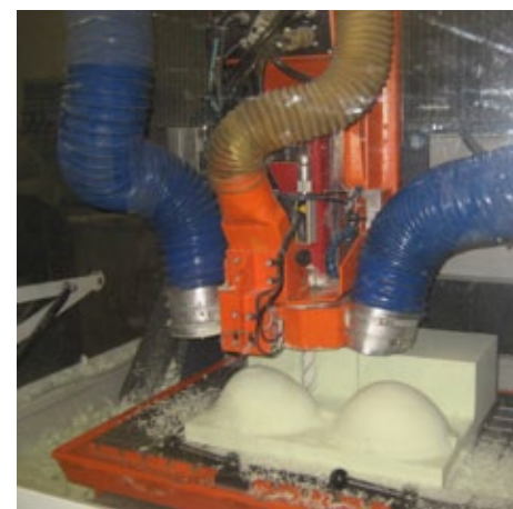
Creating the CAD-designed mold

No matter which direction of care the client chooses, Cesare Ragazzi™ Laboratories will not sell anyone a program or product until the client is also seen by an on-staff dermatologist. The doctor completes a medical questionnaire with the client and does a physical work-up.