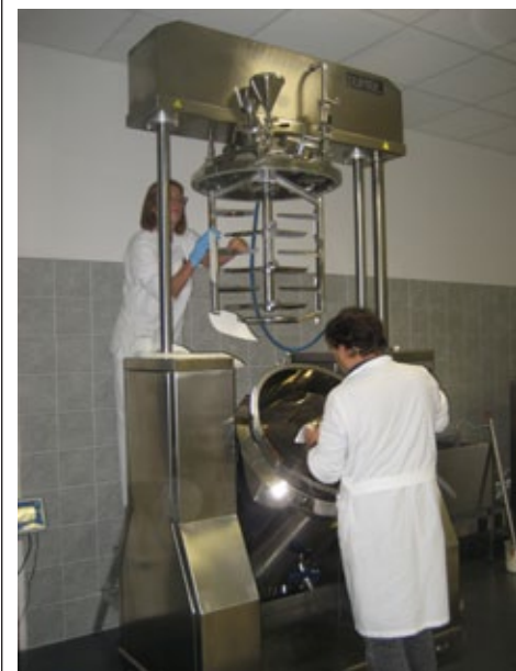
Preparing to mix the polymers that form the base

Delivery of a CR system takes place in one of the company's tres-chic clinics, found throughout Italy and a few other countries. The salon furnishings are elegant and comfortable, designed to give a client the sense of being of a luxurious spa. The staff is uniformly friendly and accommodating. They