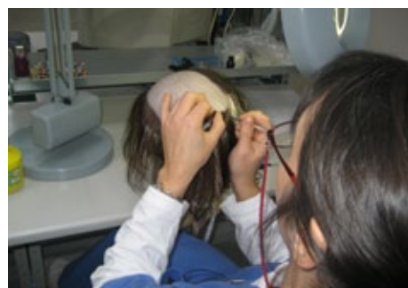
Hair implanted directionally into base one at a time

The CRL system begins with a pattern made of the exact outline and shape of the client's hair loss area and a plaster-of-Paris reproduction. The inside of the plaster cast is then "read" by a patented Cesare Ragazzi™ CAD software system that in turn sends the mold's inner shape and pattern to yet another patented CAM software milling machine. This machine (effectively a 3D printer) can at the same time, produce up to 4 exact "positive" forms on which the foundation is to be built. A special polymer resin mixing machine produces the proprietary compound, which will ultimately be tinted to match the client's scalp color. By doing this, the company believes, that wherever the client's own scalp or that of the system is exposed, the appearance will be the same. Multiple coats of liquid polymer are then applied on the base form to create the foundation. Once finished, the thin (and tapered at the edge) base is cured. It is now ready for hair to receive the designated hair.