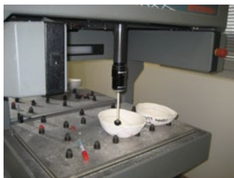
Plaster cast measured by way of CAD System

With proper care, Stefano says, a typical client will rotate between 3-4 hair systems at a time. Based on lifestyle and care, these systems are indicated to last 2-4 years. Stefano stocks hair in a wide variety of colors and textures. I saw