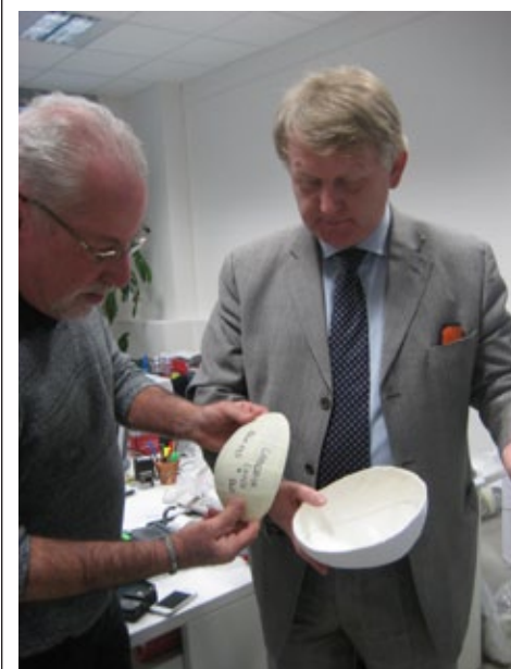
Examining CAD-designed base

attach the system. Once dry and secure (and I do mean "secure"), the hair is ready to be cut and styled. The CRL system hair follows the flow and direction of the client's own hair growth pattern. I was impressed that the hair system was cut and then styled in place with little more than a blow dry. The hair seemed to fall into place and blend with the existing hair without much use of brushes or combs. The client I watched a CRL System delivered to used no hair product to hold his hair in place. The client just shook his head and the hair simply fell into place. The natural movement of the hair was impressive.