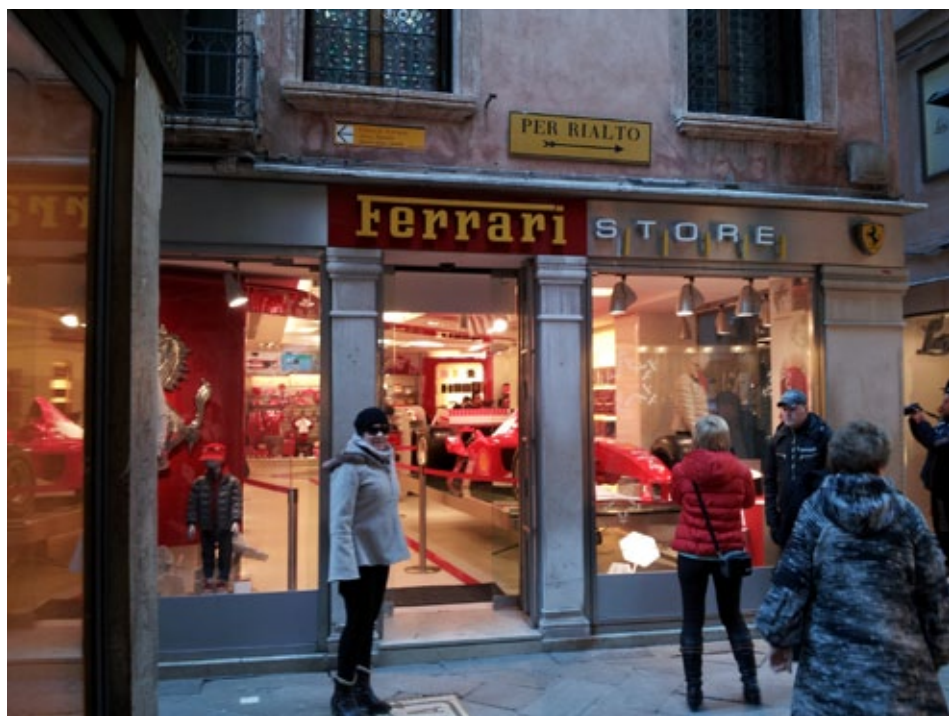
Italy - Land of style, flair and passion

boxes of this hair stacked from floor to ceiling. More important, CRL offers hair lengths up to 20 inches. Of course the longer lengths are pricier, however, as we in the business know, many women will pay any price to get the hair they want. Looking back at the first young lady I met wearing a CRL system with 18-inch length hair, with what I consider a well-trained eye for replacements, it never occurred to me