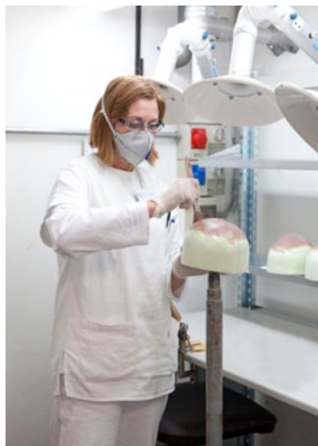
Matching the base